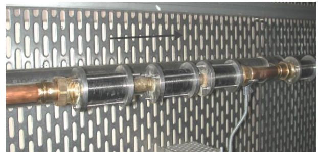
Fig. 4: Temperature cycling test

These include monolithic, short and long-fiber-reinforced extrusion and injection molding techniques, various types of back-injected inserts, fabric structures and other designs.