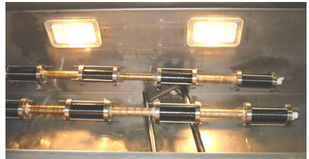
Fig. 3: Pressure cycling test

Before the mass production launch of FWH separating cans in hot-water wet rotor pumps in 2004, extensive systematic tests were carried out on plastic separating cans. In addition to static short-term pressure tests, numerous long-term studies were carried out on various types of plastic separating cans.